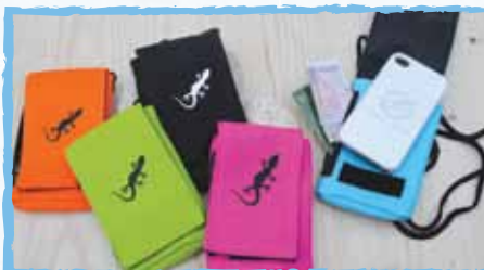
Original presents for all ages (including Festival phone cases for those tricky teenagers)