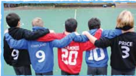
Individually personalised hoodies: the present they will love