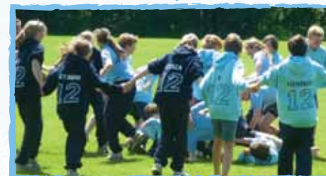
Great quality customised clothing for Leavers, Tours, Events and Teams

Shop at: www.sandlizard.co.uk t. 0843 320 5222 e: hello@sandlizard.co.uk