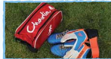
Fantastic NEW accessories: bootbags, washbags, wallets, bracelets & phone cases